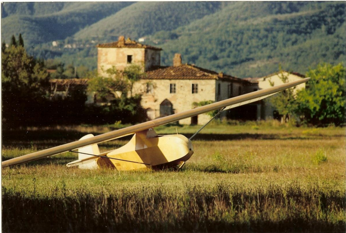
Hutter in Tuscany (Will Stoney)