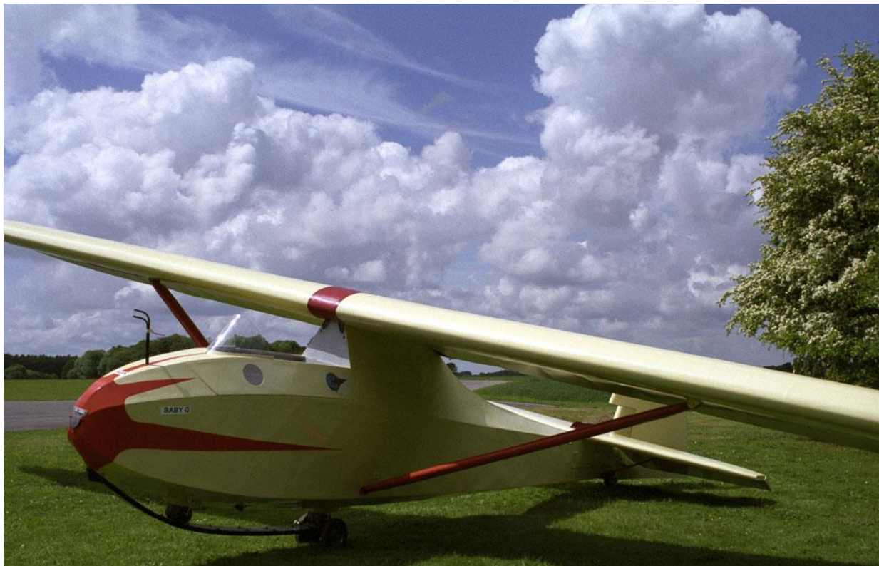
AQN at Lasham