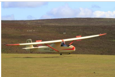
AQN at the Long Mynd